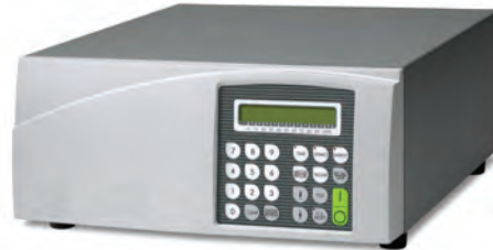
Model MG Power Supply

Ultra Sonic Seal offers its latest line of ultrasonic metal welders combined with the new G-Series power supplies to create a powerful and precise system designed to handle a broad spectrum of applications.