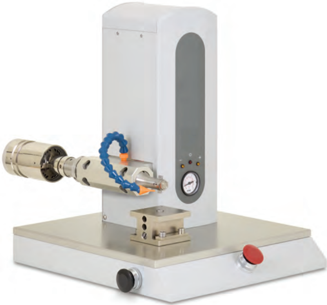
Model M20 Metal Welder