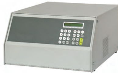
Model MG Power Supply

Ultra Sonic Seal offers its latest line of ultrasonic metal welders combined with the new G-Series power supplies to create a powerful and precise system designed to handle a broad spectrum of applications.